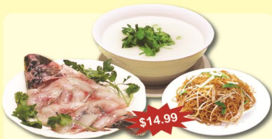
原條立魚粥配豉油皇炒麵 Whole Tilapia Porridge w/ Soy Sauce Noodle

Special promotion is subject to availability. For dine in only