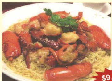
上湯龍蝦伊麵 Boston Lobster w/ E-Fu Noodle in Supreme Sauce